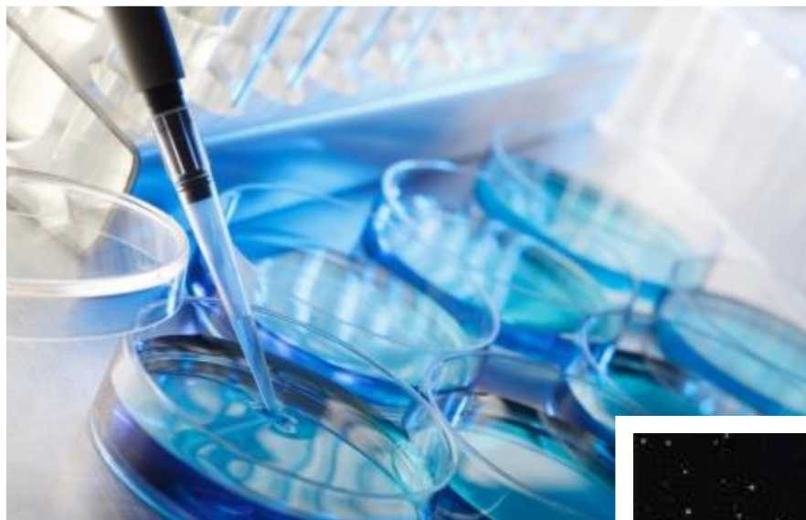
In vitro methods